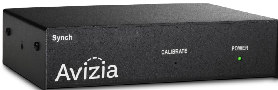
Figure 1. Avizia Synch

Merge the power of interactive whiteboards and video conferencing with Synch to create an exceptional multifunctional collaboration tool. Synch enables you to use all of the great interactive whiteboard features and at the same time use part of the interactive whiteboard to display your video conference.